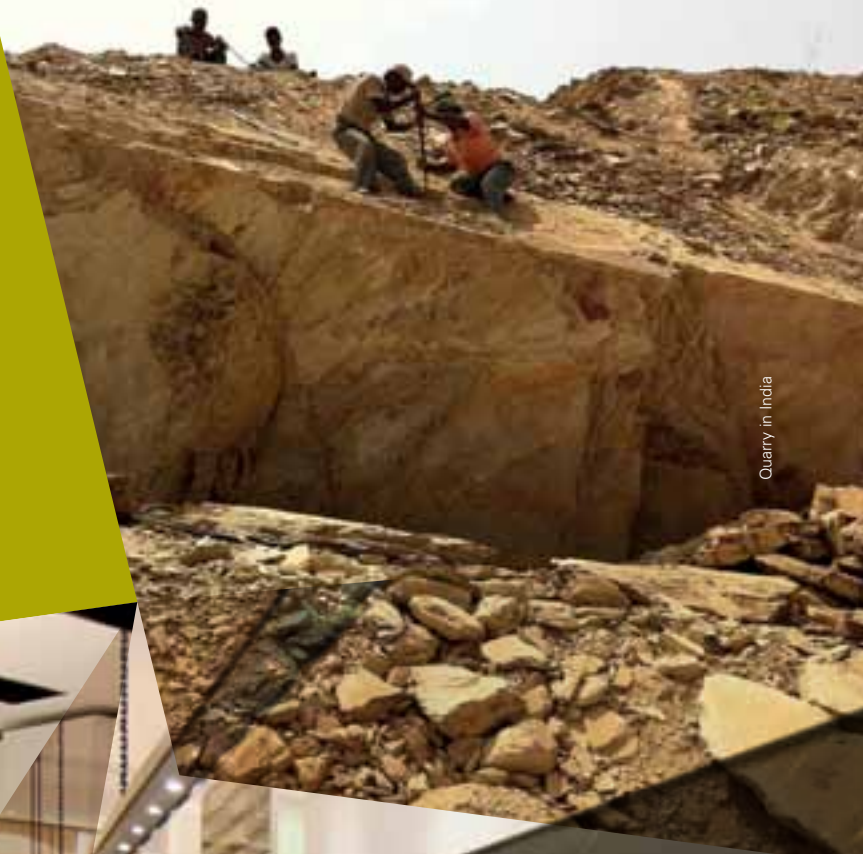
Quarry in India